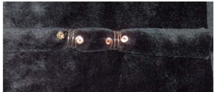
Two wire wrap rings in copper by Warren Collins.

Here is a cute easy to make adjustable wire wrap ring. Using 10" of 16 or 18 ga wire and a ring mandrel, make a cinnamon bun, then wrap it around the mandrel to your size, (3 times around) then continue with the 2nd cinnamon bun, and its ready to wear.