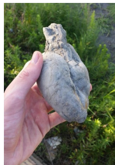
HEART LIKE A ROCK!