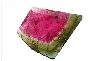
At least it's seedless "watermelon".