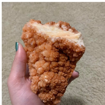
This "Southern fried chicken" and "potato" would be one heavy meal!