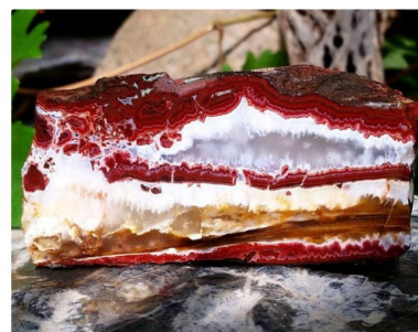
Even a dollop of whipped cream on top wouldn't make this "strawberry cheesecake" any easier to eat.

And the main course: This "Cheeseburger with the works and a side of fries"