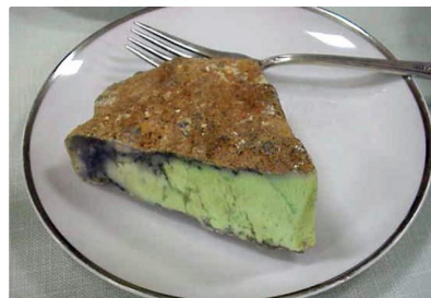
Oh my, this "key lime pie"!