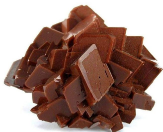
This is some tooth-cracking "chocolate!"

Photos of rocks and minerals that look like food, from boredpanda.com